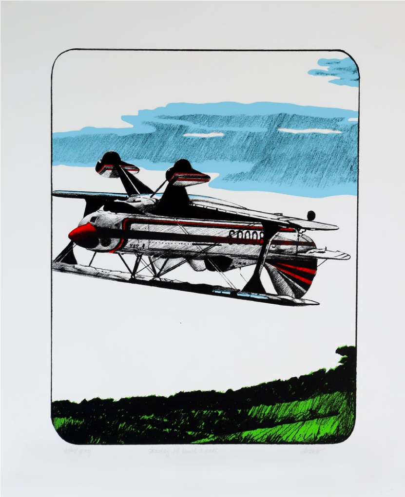
Joyce Arons Someday I'll Build a Boat Silkscreen 22 x 28 in. $200

Mostly we are under the sky. Sometimes the sky is under us. That's why we fly.