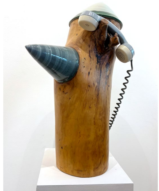
Michael Brod Call Home Call Mixed media - clay, wood, phone parts 26 h x 17 d (approx.) $1,000