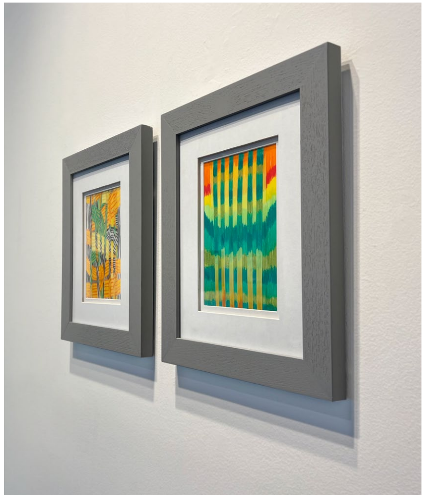
Enmesh II 4.5 x 6.5 in. Colored Pencil on Mylar $115

These images were made with colored pencil on mylar and then cut into strips and rearranged. This two-step process allows for me build the image using two different approaches. Weaving these strips together creates new imagery that feels enmeshed. Tightly weaving organic designs brings to mind the understory of a forest, and how interconnected the plants are at nature's floor.