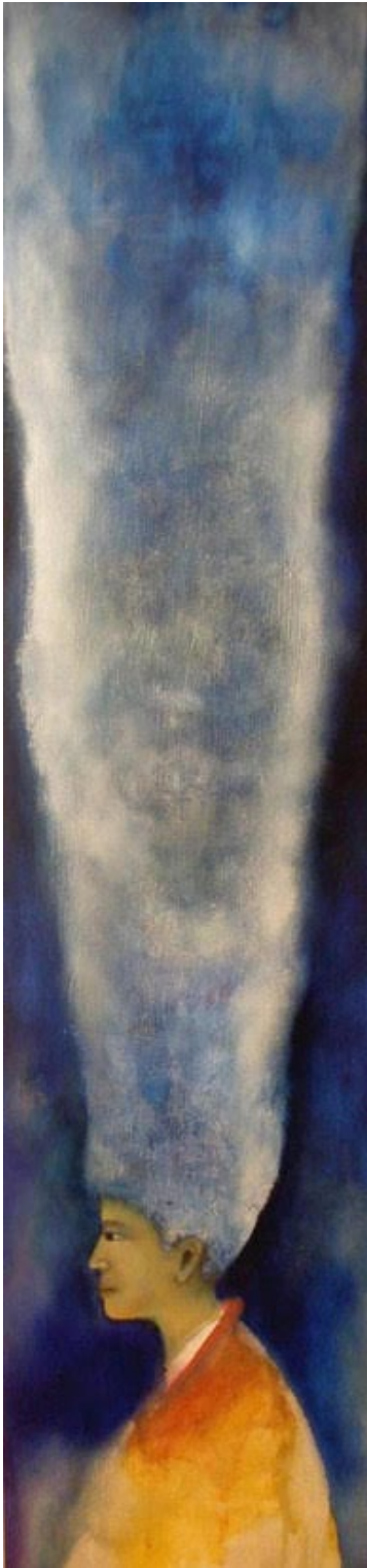
(Left) Jennifer Axinn-Weiss Becoming Sky Oil on wood panel 17.75 x 79 in. $2,500