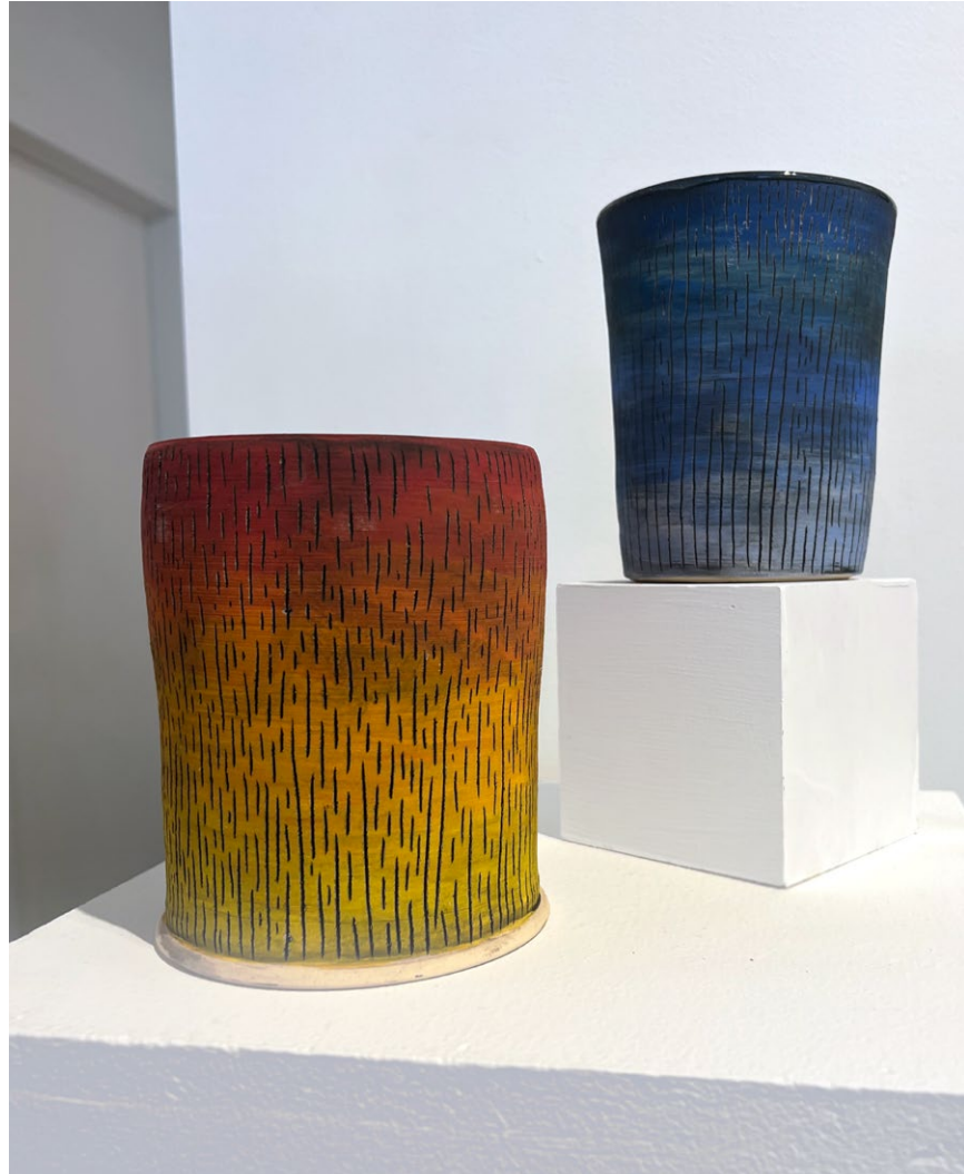
Margaret Savino Running Hot Ceramic - Sgraffito 5.75 h x 5.5 d in. $80