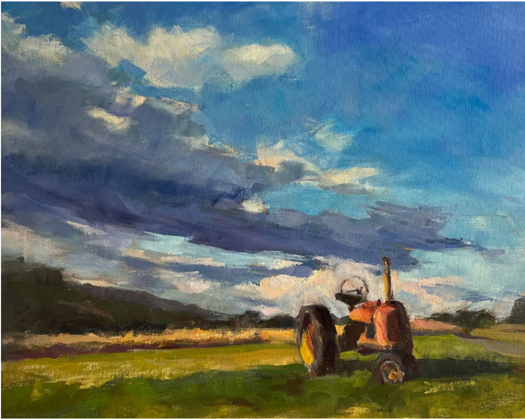
Rosemary Hanson 5:00 at Black Snake Brewery Oil on canvas 16 x 20 in. $900

I have spent many evenings at Black Snake Brewery, soaking up the casual country setting (and delicious beer!) This lone tractor always sparks our imagination - evokes the feeling of history that is so abundant in our town. It looked particularly proud and vulnerable under the looming sky that night.