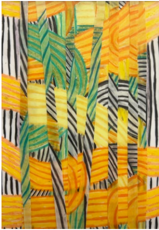
Kristin Hutton b.1994 Enmesh I Colored Pencil on Mylar 4.5 x 6.5 in. $115