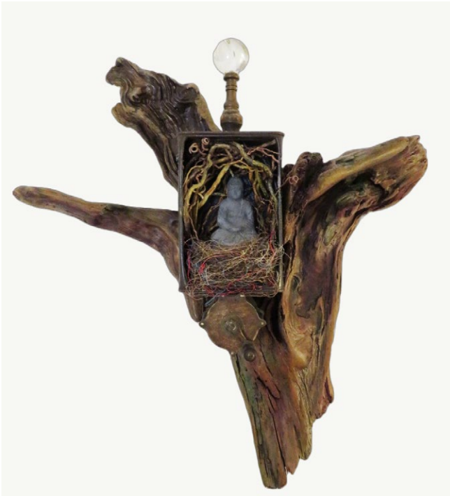
Lisa Winika Nested Buddha No.5 (Sleeping in the Forest) Natural and found objects 15 x 15 x 5 in. $450